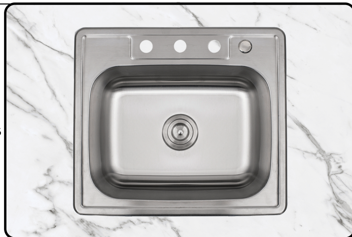
Shown with Basket Strainer Drain and 1 Faucet Hole Cover

The 25" x 22" x 9" Drop-In Sink is a premium kitchen upgrade, expertly crafted from T304 stainless steel for lasting durability and a refined finish. Designed to fit a 30" cabinet or be custom-fitted in a 27" space, this versatile model includes everything needed for a seamless installation or easy replacement. Its timeless design allows for effortless mounting with the included hardware and template, while the fully insulated basin with sound-deadening pads ensures quiet, reliable performance. Additional accessories also available.